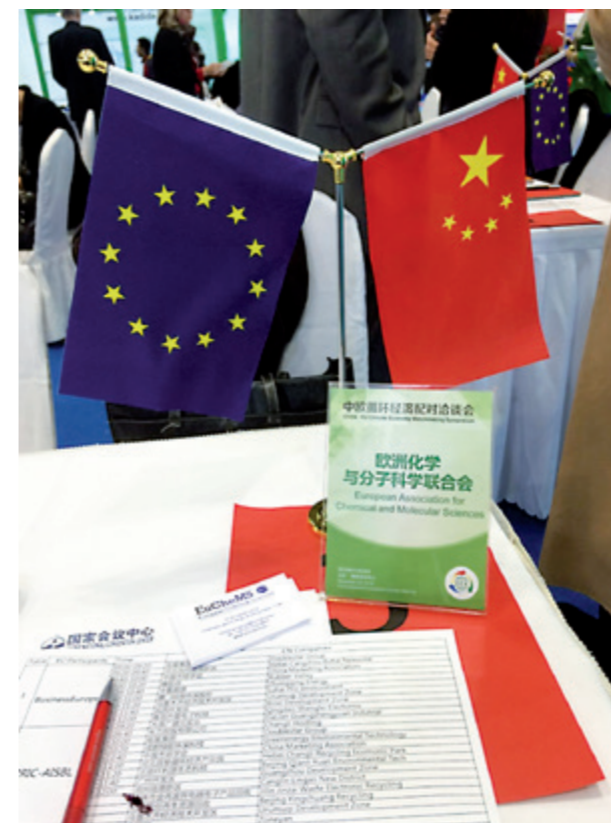
EuCheMS at a networking session during the mission to China

The scope of these missions was to deepen relationships and align policies on the circular economy between EU and these countries. With Chile being one of the strongest South American economies and China being the world's second biggest economy, the adoption of circular economy measures is both an economic opportunity and an environmental need.