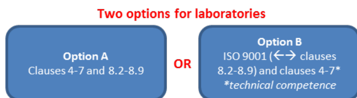
Figure 2: Management system options Annex B gives more detailed information

There are two management system options (see Fig. 2).